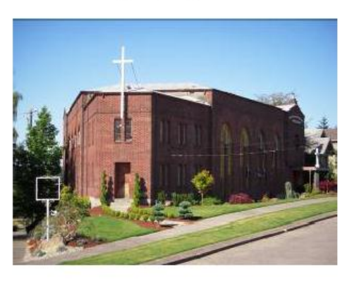
One in the Spirit